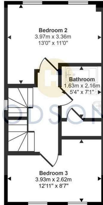
First Floor Approx 33 sq m / 353 sq ft