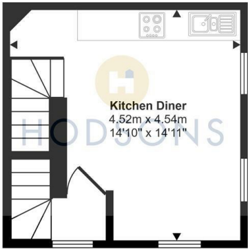
First Floor Approx 20 sq m / 219 sq ft