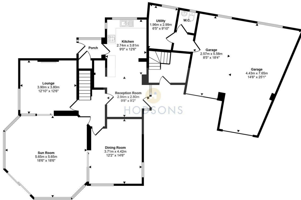
Ground Floor Approx 151 sq m / 1627 sq ft

This floorplan is only for illustrative purposes and is not to scale. Measurements of rooms, doors, windows, and any items are approximate and no responsibility is taken for any error, omission or mis-statement. Icons of items such as bathroom suites are representations only and may not look like the real items. Made with Made Snappy 360.